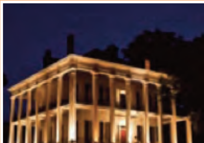
DUNSEITH MANSION Natchez, Mississippi