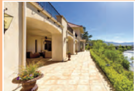
NIXON MANSION Reno, Nevada

Other awards, over the years, have including a refurbished downtown commercial building in Kansas City, a mansion in the bayous of Louisiana, a new town development in Arizona.