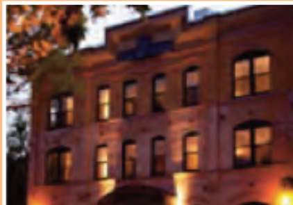
CHAUVET HOTEL Glen Ellyn, California