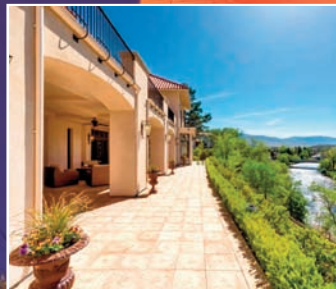
Nixon Mansion Residence Reno, Nevada