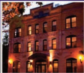
Chauvet Converted Hotel Glen Ellyn, California