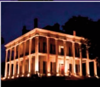
Dunseith Mansion B&B Conversion Natchez, Mississippi