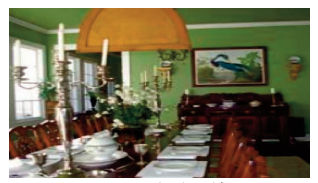
Operating Bed and Breakfast

NOT TO LATE TO SUBMIT YOUR PERSONAL NOMINEE! katy1@cfl.rr.com