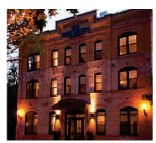
The Chauvet – Glen Ellyn Converted Hotel