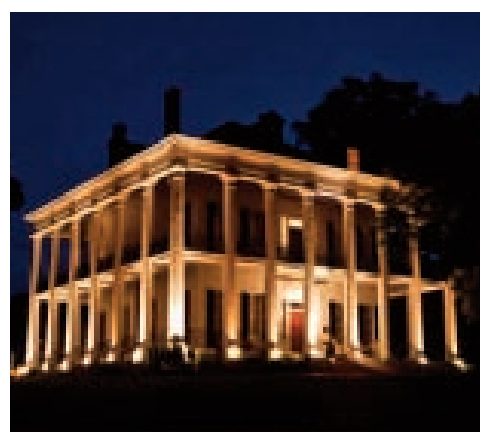
Dunleith – Natchez Mansion Historic B&B Residence