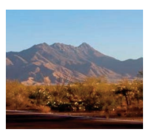
Stone House – Sahuarita, AZ Residential Lots