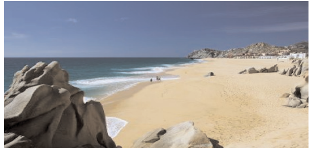
Cabo San Lucas

to bring your sunscreen and sun glasses with you and expect a very warm welcome!