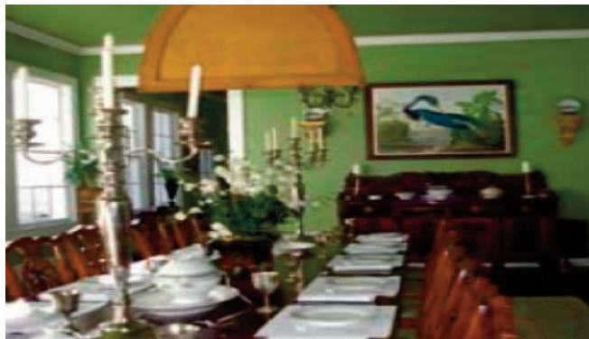
Operating Bed and Breakfast

date of construction, it can be assigned to the period of the flourishing of this style in the lower Mississippi Valley: 1830-1850. Windows in the front block of the house are six-over-six sash of typical proportions and are furnished with their original fixed-vane shutters. Preceding the front is a well-proportioned, architecturally correct portico encompassing the three central bays of the structure, with wood box columns. A finely detailed entranceway repeats the Doric order of the portico including a heavy, four-panel door with sidelights and transom sash.