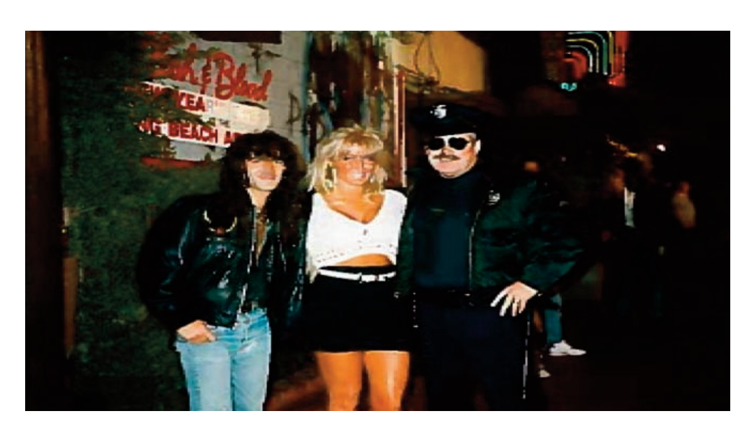
Guess Who and Win Significant Honors and Accolades!

Today's photo features one of our own who played a role is the unforgettable music video "Call it Poison" by the "Escape Club" circa 1991. Who, using your deductive skills, among this trio of stars, could it be?