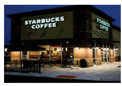
Prime Investment Properties

1. If you are looking to let go of the hassles associated with being a landlord, then you