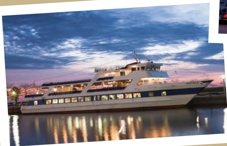
A Gala Dinner/River Cruise Aboard the Good Times III