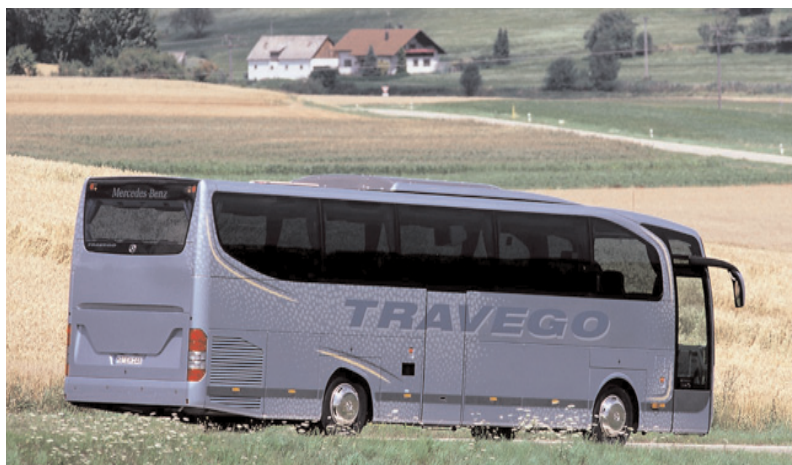
Typical New England bus tour (actual buses may vary).

Trinkie Watson of Lake Tahoe has long had a desire to see New England in its unmasked fall splendor; and so she, in conjunction with Bunny and Ken Libby , is arranging for an after Retreat two to three day excursion for AREA members to enjoy this as the trees showcase their fall colors. Trinkie would like to know who among the attendees would be interested in such an adventure. The plan is to make the Stowe Mountain Lodge the base camp and to take day trips to selected locations in New England returning each evening to the Lodge. (The Lodge has generously agreed to extend its low rates for up to three days after the Retreat and the added cost would be sharing a portion of the bus rental plus out of pocket expenses.) So, since we are there, why not take advantage of the opportunity? Plus it's one more way to get to know one another on a personal level. For more information, please contact Trinkie at twatson@chaseinternational.com 530-582-0722 or Carl at carl@areamericas.com 520-625-9207.