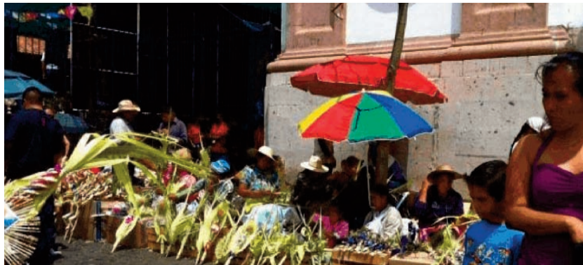
Uruapan has numerous cultural events during the year, but the premiere event takes place during Semana Santa, when 1,300 artisans from 47 villages come to exhibit and sell their wares in the main plaza.